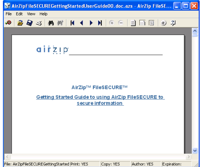
functions and context menus work the same.

To determine what access permissions you have for a file you are using, select the "File > Properties" menu item on the Reader or click the Properties button on the taskbar. The Permissions Property window such as that above will display your